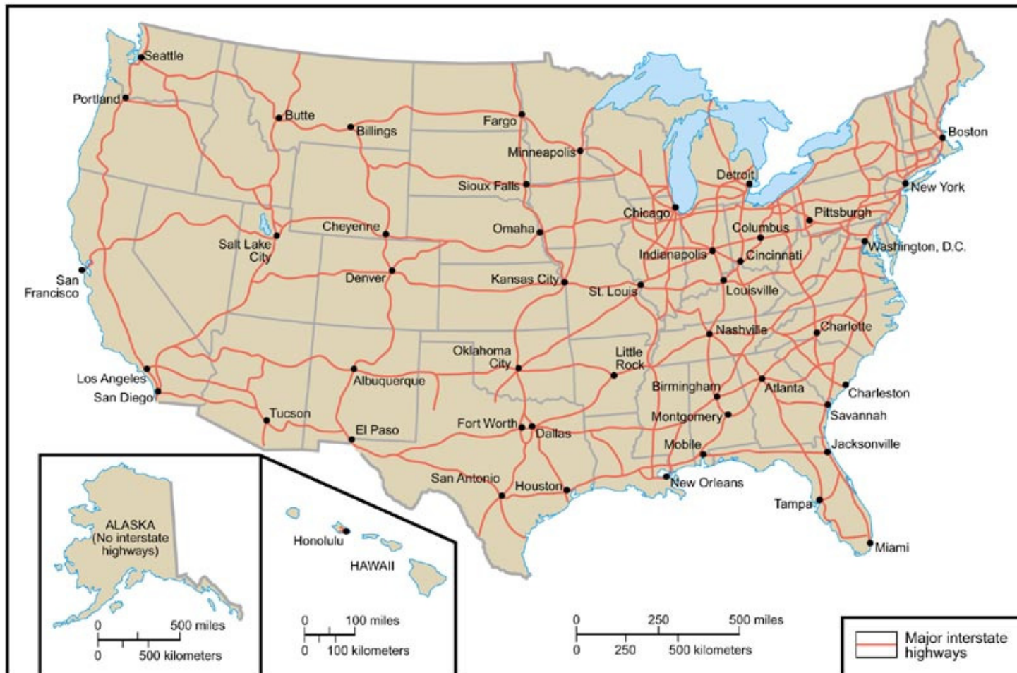
THE INTERSTATE HIGHWAY SYSTEM